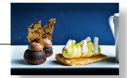
Private Events in our restaurant up to 100 people in cocktail style and 55 seated dinner